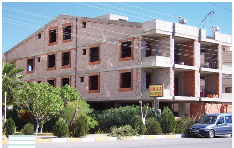
GUZELOBA HOUSES LOCATION Antalya, Turkey EMPLOYER FENER İnşaat Ltd. Şti. CONTRACT ROLE Main Contractor CONTRACT YEAR 2005 CONSTRUCTION AREA 1950 m2