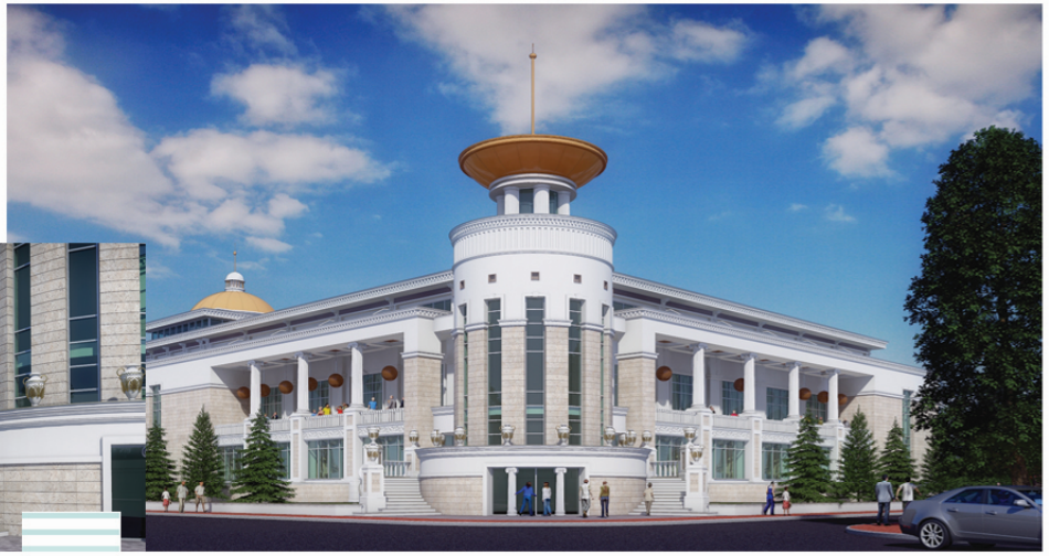
HOTEL & SPA LOCATION Nalchik, Russia EMPLOYER O. Gurtuev CONTRACT ROLE Main Contractor CONTRACT YEAR 2013 CONSTRUCTION AREA 9200 m2