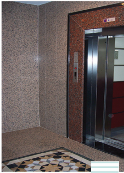
LARA HOUSING PROJECT LOCATION Antalya, Turkey EMPLOYER FENER İnşaat Ltd. Şti. CONTRACT ROLE Main Contractor CONTRACT YEAR 2000 CONSTRUCTION AREA 3480 m2