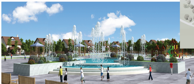
CHEGEM HOUSING COMPLEX LOCATION Chegem, Russia EMPLOYER O. Gurtuev & Qatar Investor CONTRACT ROLE Main Contractor CONTRACT YEAR 2014 CONSTRUCTION AREA 55000 m2