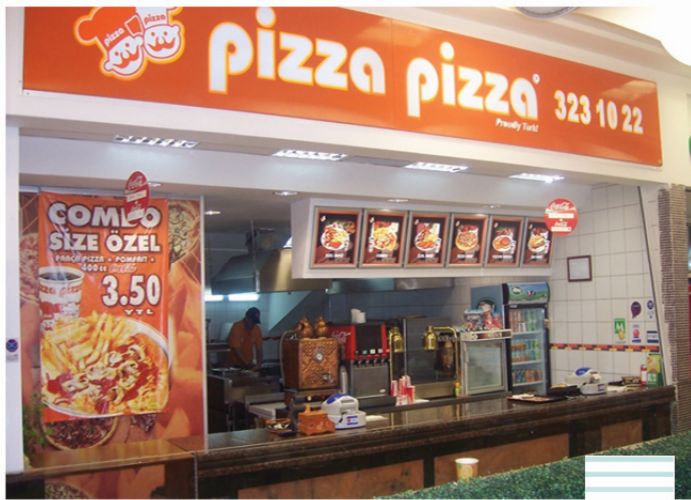
PIZZA PIZZA BRANCHES LOCATION Antalya, Turkey EMPLOYER FENER İnşaat Ltd. Şti. CONTRACT ROLE Main Contractor-Administrator CONTRACT YEAR 2001, 2002, 2005, 2006 CONSTRUCTION AREA 420 m2