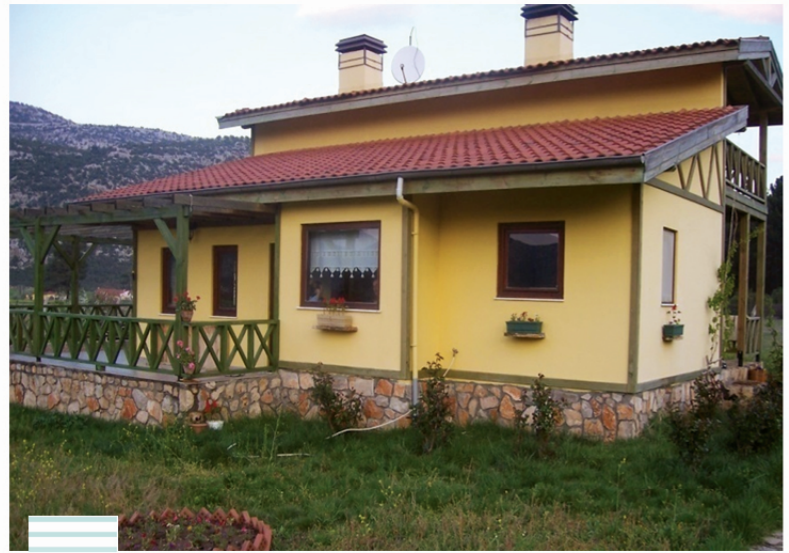
BADEM COUNTRY HOUSES LOCATION Antalya, Turkey EMPLOYER FENER İnşaat Ltd. Şti. CONTRACT ROLE Main Contractor CONTRACT YEAR 2004 CONSTRUCTION AREA 1600 m2