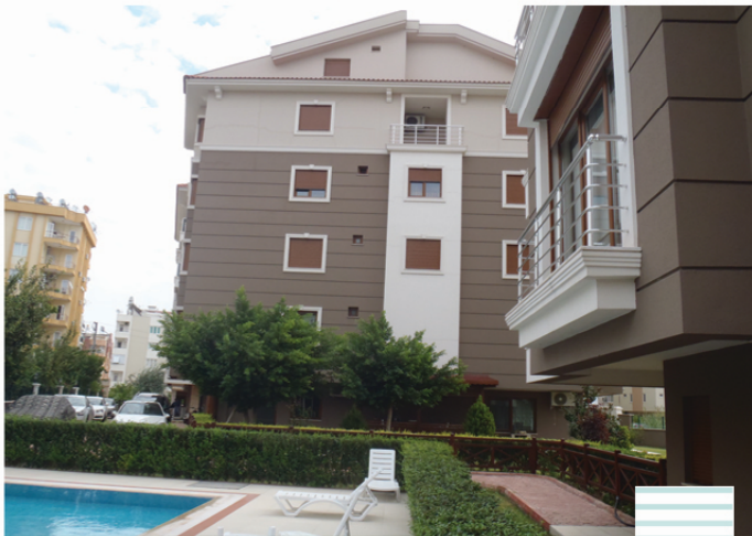
LILYUM HOUSING PROJECT LOCATION Antalya, Turkey EMPLOYER FENER İnşaat Ltd. Şti. CONTRACT ROLE Main Contractor CONTRACT YEAR 2007 CONSTRUCTION AREA 5200 m2