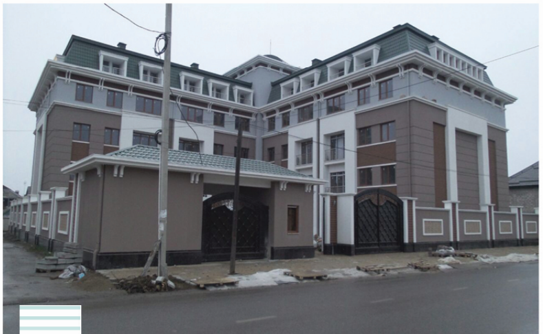
CHERNICHEVSKAYA HOUSING PROJECT LOCATION Nalchik, Russia EMPLOYER O. Gurtuev CONTRACT ROLE Main Contractor CONTRACT YEAR 2012 CONSTRUCTION AREA 9700 m2